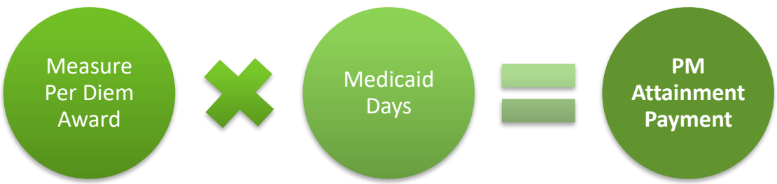
Exhibit 5. NF VBP Performance Measure Attainment Award Calculation

To calculate the full attainment award earned by a facility for a designated measure, multiply the per-diem attainment (determined by DMAS) by the number of applicable Medicaid days in the performance period (Exhibit 5).