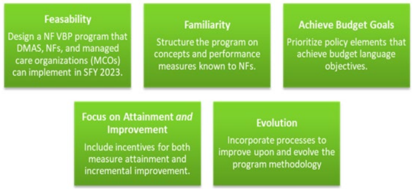
Exhibit C - DMAS NF VBP Design Principles Considered-feasibility, familiarity, budget goals, Attaining and Improving, Evolving

working with stakeholders as part of implementation and feedback efforts related to NF VBP.